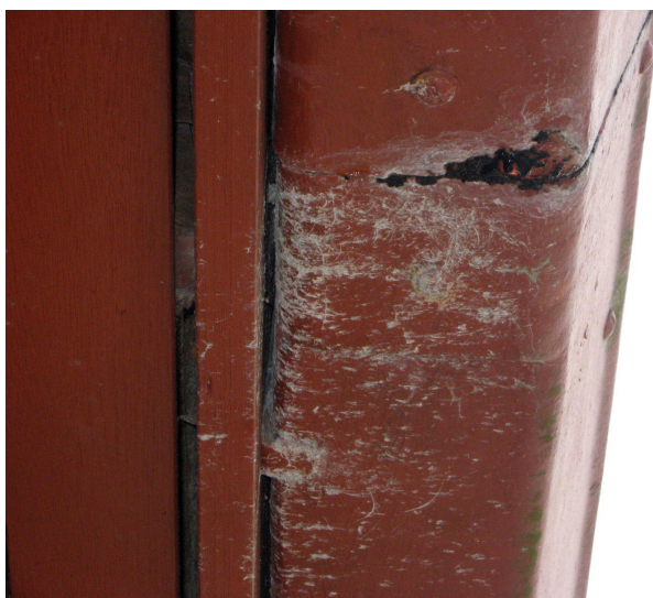
FIGURE 12: AC debris under roof guttering from AC roof