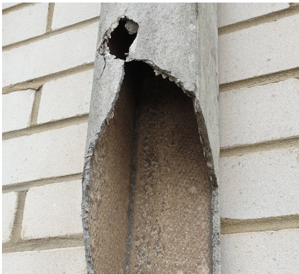
FIGURE 10: Damaged AC downpipe