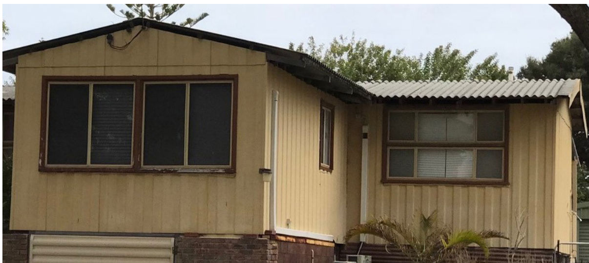
FIGURE 14: Residence with multiple AC structural components