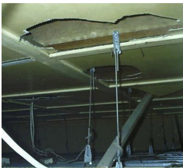
FIGURE 8: Original asbestos cement ceiling damaged when suspended ceiling system installed