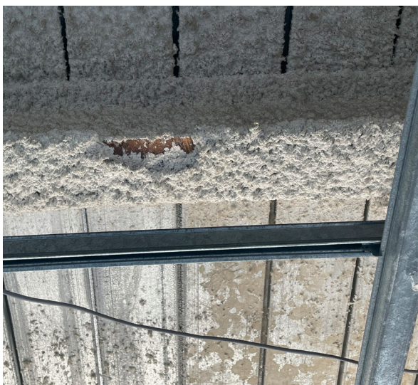
FIGURE 16: Sprayed coating on framework with overspray