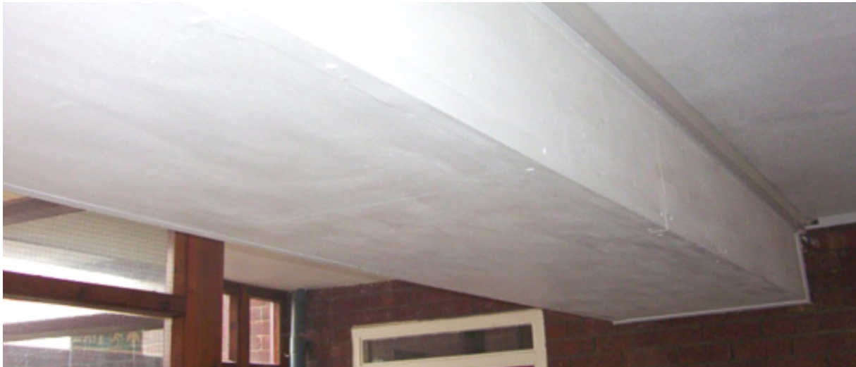
FIGURE 15: Airconditioning duct clad in low density fibreboard sheeting