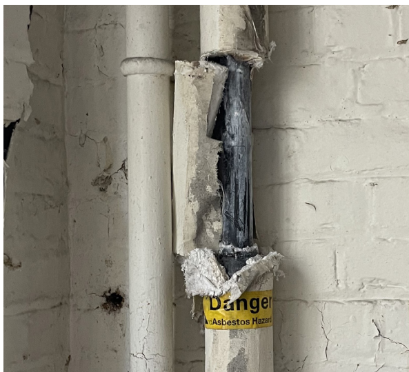
FIGURE 6: Damaged asbestos insulation to pipe