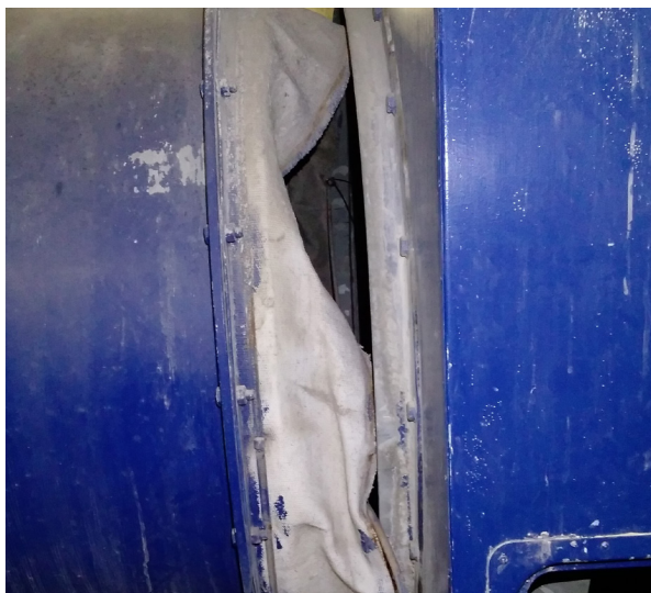
FIGURE 4: Woven asbestos flexible duct seal on vibration isolator