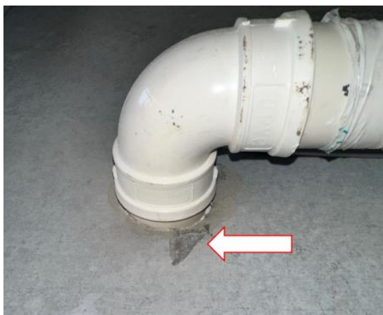
Figure 3: Floor backing