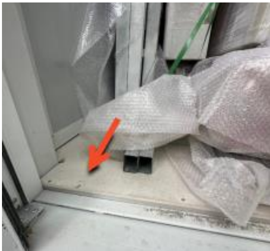
Figure 1: Interior compressed fibre cement flooring