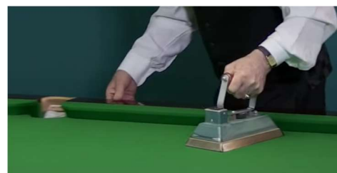
Figure 2: Image shows use. The model shown is not the affected iron.

Irons imported with asbestos are prohibited imports. The irons maybe lawfully imported without the asbestos layer.