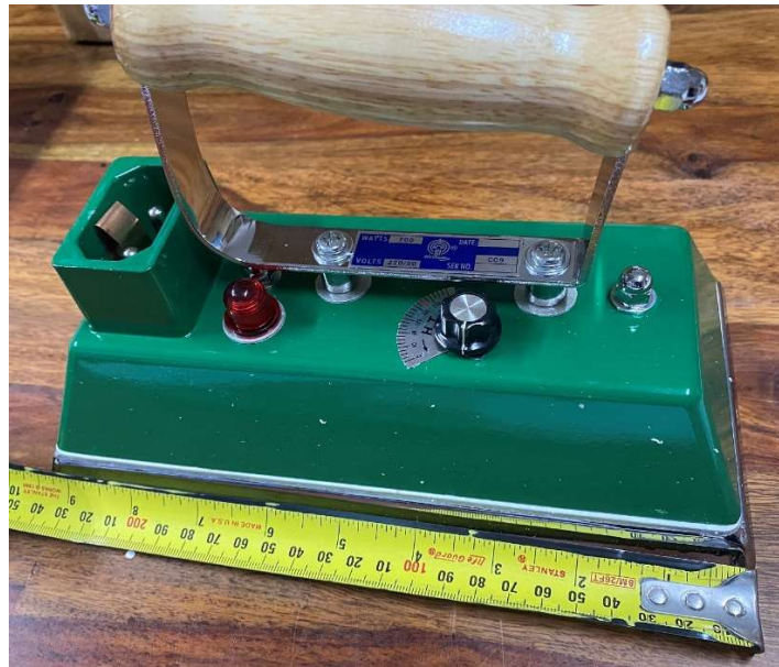
Figure 1: Billiard table iron with (white coloured) asbestos insulating layer, visible between the green housing and lower steel plate.

This safety alert provides information about the potential presence of asbestos in the insulation layer of hand-held billiard table irons and associated iron stands, from the People’s Republic of China (China). Online sellers of these items exist in China, India and Taiwan. The item identified in Australia was imported from a supplier in China. A similar but not identical item, with no asbestos, is marketed from the United Kingdom.