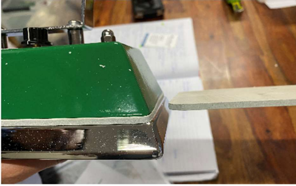
Figure 3: Insulating layer in situ.