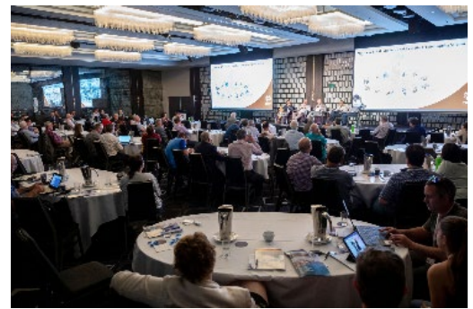
Photo: CBFCA National Conference 2018 at Sheraton Grand Sydney Hyde Park

ASEA participated in the trade show component of the event which provided an opportunity to network with stakeholders and provide further information on the potential risk of importing goods containing asbestos and the permits application system and process.