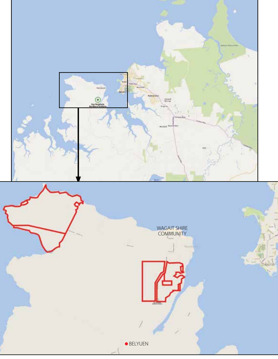
Figure 17: Commonwealth-owned areas of Cox Peninsula indicated in red