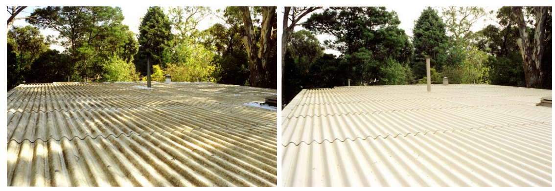
Figure 1: Photographs showing the application of an encapsulation product to an asbestos roof17

The estimated lifespan of the encapsulation depends on the condition of the roof, the environment is exposed to and the application of the product. Some of the manufactures provide warranties on the encapsulation of a roof of up to 10 years, if it is applied by certified contractors. However, the typical lifespan may exceed this. One company interviewed commented that they had a request to respray a roof 11 years after the first coating, as an audit identified fibres in the gutters. Inspection of the roof showed a few minor areas where the coating was peeling off<sup>18</sup>. Another company noted that the roof of the QLD observatory was encapsulated in 1991, and a recent inspection showed it still reflecting around 85% of original qualities and the sealant is in 100% condition.<sup>19</sup>