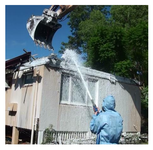
Figure 2: Use of Foamshield to encapsulate a fire damaged house prior to and during demolition 22

There are also special circumstances in which lockdown sealants are required. Firstly in the case of fire damaged houses containing asbestos – in this circumstance, after an inspection is undertaken a PVA sealant is applied as a temporary measure. This is also a circumstance in which a product like Foamshield can be highly beneficial, as it can contain any friable fibres without the need for the erection of a full enclosure. An example showing the use of Foamshield to contain asbestos material in a fire damaged house is given in Figure 2. In this example, the house internal walls were a mixture of asbestos sheeting and plasterboard. Air monitoring results obtained during the removal process confirmed a fibre count of <0.01 f/m. In addition, by using the Foamshield, contaminated water runoff from the site was eliminated.