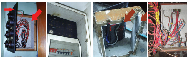
Figure 2: Asbestos cement and asbestos insulation mixed linings inside the electrical box itself.