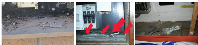
Figure 5: Asbestos millboard, asbestos resin board debris and asbestos insulation board debris in the bottom of electrical cabinets.

In older electrical cabinet/boxes, quite often there is already asbestos-containing debris inside from previous drilling/ installation work. This can be in the form of asbestos-resin board dust, asbestos millboard debris, asbestos cement or asbestos insulation board debris. This can be particularly dangerous as opening the box or cabinet will be enough to cause asbestos fibres to become airborne and potentially “in your face”.