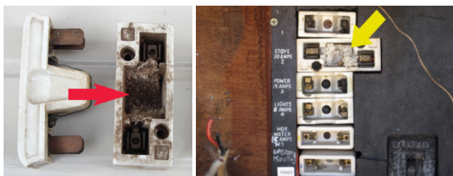
Figure 3: Woven asbestos textile fuse linings are common for large and small fuses.