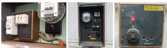
Figure 1: Asbestos based resin mounting boards used across Australia.

Main electrical meters, fuse boxes and boards hold a number of asbestos-containing materials like based resin board; generally black in colour with brand names such as "Ausbestos" or "Zelemite" stamped on them. Behind these boards can be insulating asbestos side, back and top panels of asbestos cement sheet, asbestos insulation board, asbestos millboard or even a combination of them. Asbestos millboard is like a paper or cardboard form of asbestos. (See figures 4 & 5)