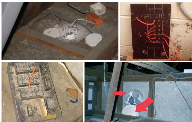
Figure 6: Discarded asbestos waste onsite. Often you will find asbestos debris discarded such as this asbestos insulation board ceiling pieces left lying in the roof, discarded electrical backing board, entire fuse box and asbestos cement pieces where a ceiling extractor has been installed.