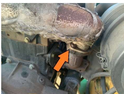
Figure 4: Exhaust flange gasket