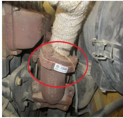
Figure 6: Exhaust flange gasket