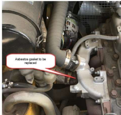
Figure 2: Exhaust manifold gaskets