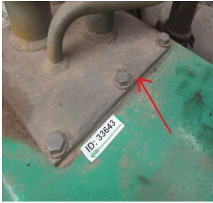
Figure 5: Hydraulic tank gasket