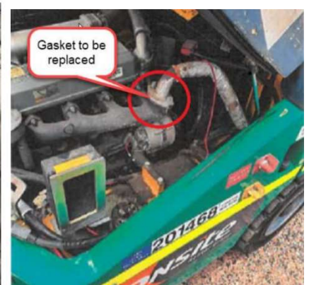
Figure 3: Exhaust manifold gaskets