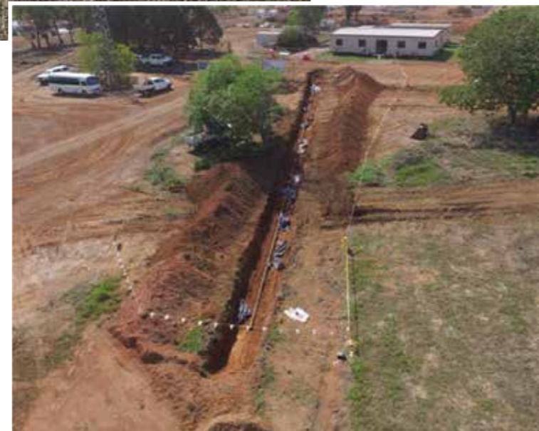
Figure 16: Removal of buried asbestos conduit