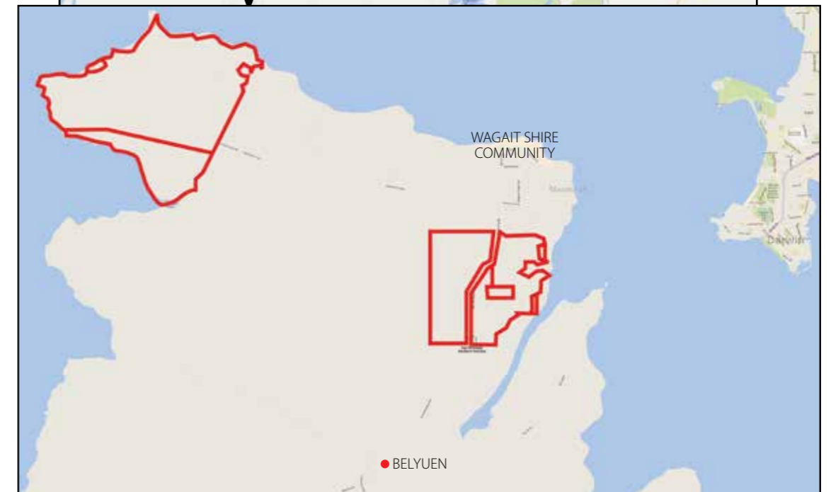
Figure 17: Commonwealth-owned areas of Cox Peninsula indicated in red